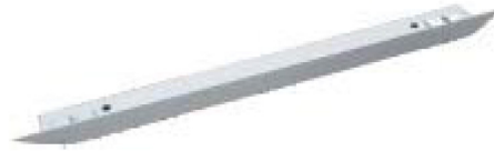
T-Frame Side Support (2 pcs.)