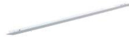
T-Frame End Support (2 pcs.)