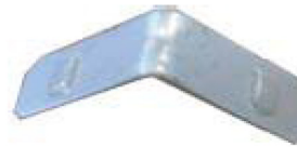
T-Frame Lock Angle (4 pcs.)