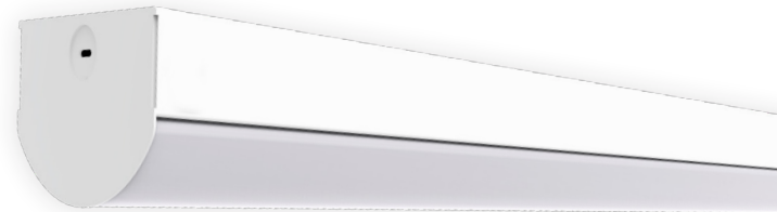
The Fidelux FSTRS Series provides wide application flexibility and years of durable, reliable, and energy efficient operation